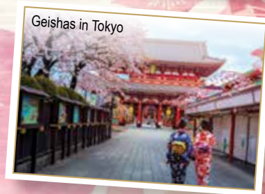
Geishas in Tokyo