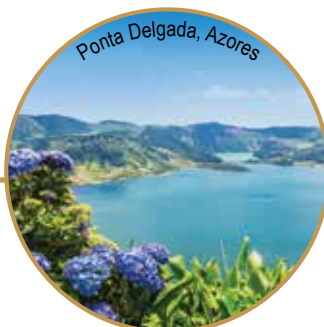
Ponta Delgada, Azores