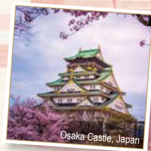
Osaka Castle, Japan

You'll never forget a visit to the sensory explosion that is Tokyo. Capital of Japan, this is a city where you'll find centuries-old culture jostling for a position next to cutting-edge technology – a fabulous blend of history and modernity that has to be seen to be believed. To get a feel for Tokyo's natural beauty, head to Yoyogi Park, where cherry blossoms are resplendent in spring. Close to the Yoyogi Park is the Meiji Jingu Shrine, established in 1920 and dedicated to Emperor Meiji who helped to open Japan up to the west. As impressive as anything else is its 40-foot gate, made of 1,500-year-old cypress. At the main shrine buildings, you may show respect by bowing twice, clapping your hands twice, making a wish then bowing once more. You may be lucky enough to catch a traditional Japanese wedding procession.