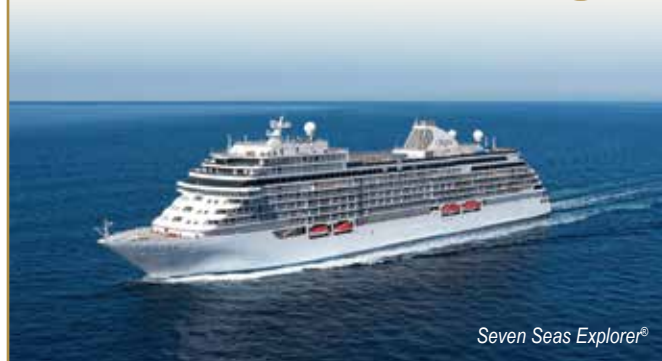
Seven Seas Explorer ®