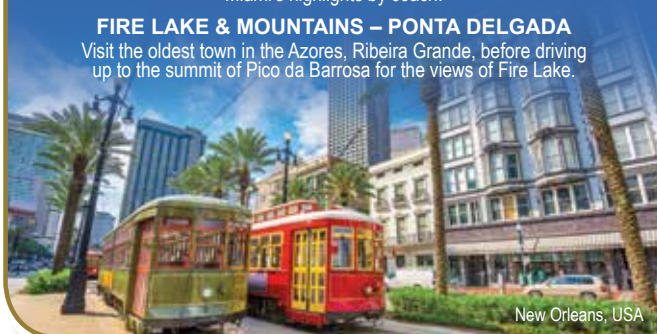
New Orleans, USA

Visit the oldest town in the Azores, Ribeira Grande, before driving up to the summit of Pico da Barrosa for the views of Fire Lake.